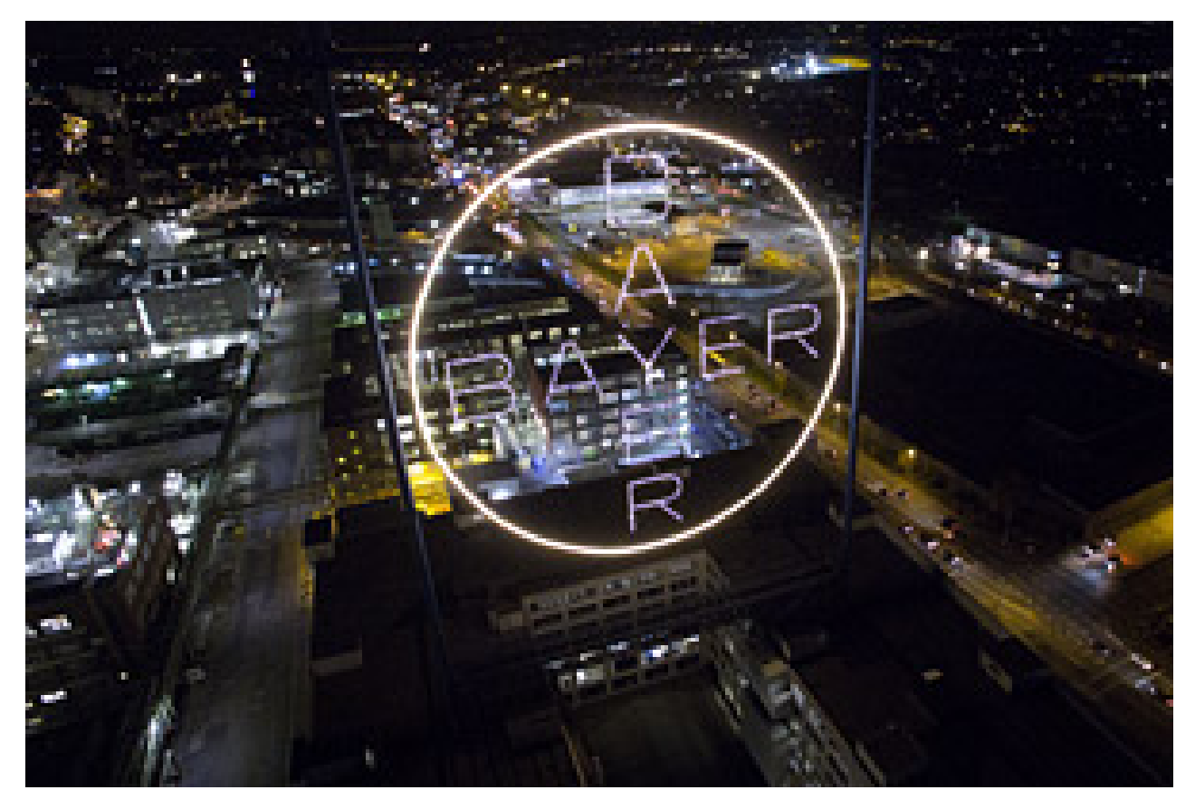
1933 the illuminated Bayer-Cross became a landmark at the Leverkusen site

In 1929 the trademark was modified and updated for the first time when the previously slightly italicized letters were straightened. Marketing ideas reached a new peak on February 20, 1933 with a technical sensation. The Bayer Cross was displayed as a flashing illumination between two smokestacks at the Leverkusen site, 72 meters in diameter with 2,200 electric light bulbs. An illuminated circle appeared first, then the letters lit up. The Bayer Cross in Leverkusen has been redesigned and modernized several times since then. It is now 51 meters in diameter, has letters 7 meters high, and is illuminated by 1,710 bulbs- making it the biggest trademark in the world. In 2009, the original bulbs were replaced by innovative, energy-saving light-emitting diodes.