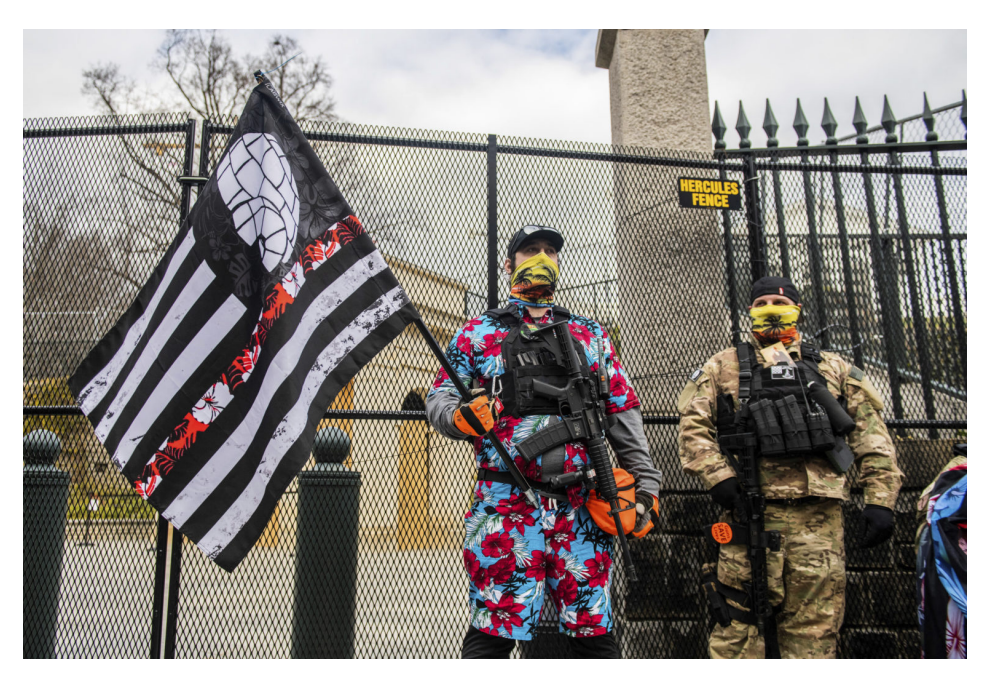
In this January 18, 2021 file photo, supporters of the Boogaloo Movement attended a second amendment rally during Lobby Day at the Virginia State Capitol on January 18, 2021 in Richmond, Virginia.

The Three Percenters movement is, similar to the Boogaloo movement, more of a brand of militant movements than a cohesive national organization. There are a multitude of III% actors, including national organizations, coalitions, local groups, and other affinity organizations. The movement's core ideological view is the ahistorical notion that only 3% of American colonists took up arms against the British, indicating their accepted position that a small number of activists can affect large amounts of change through force of arms. The III% movement has a history of violence, often picking unarmed or otherwise undefended targets (e.g. unarmed counterdemonstrators, <sup>35</sup> refugee communities, <sup>36</sup> Muslim organizations, <sup>37</sup> etc.).